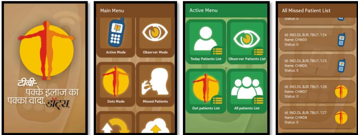
Community Health Worker Toolkit

As ZMQ wanted to create the parallel system to the RNTCP approved DOTS Methodology, so DOTS Provider were considered as an important stakeholder in the entire system as they are the ones who are in direct contact with the patients. A “Community Health Worker Toolkit” (CHW) was prepared for tracking the treatment of active compliance patients and updating the dose record of the patient (only in special cases where patient has taken the medicine but was not able to report the compliance). The toolkit updates the record based on live compliance data and helps to take immediate actions for the patients who have not taken the medicine.