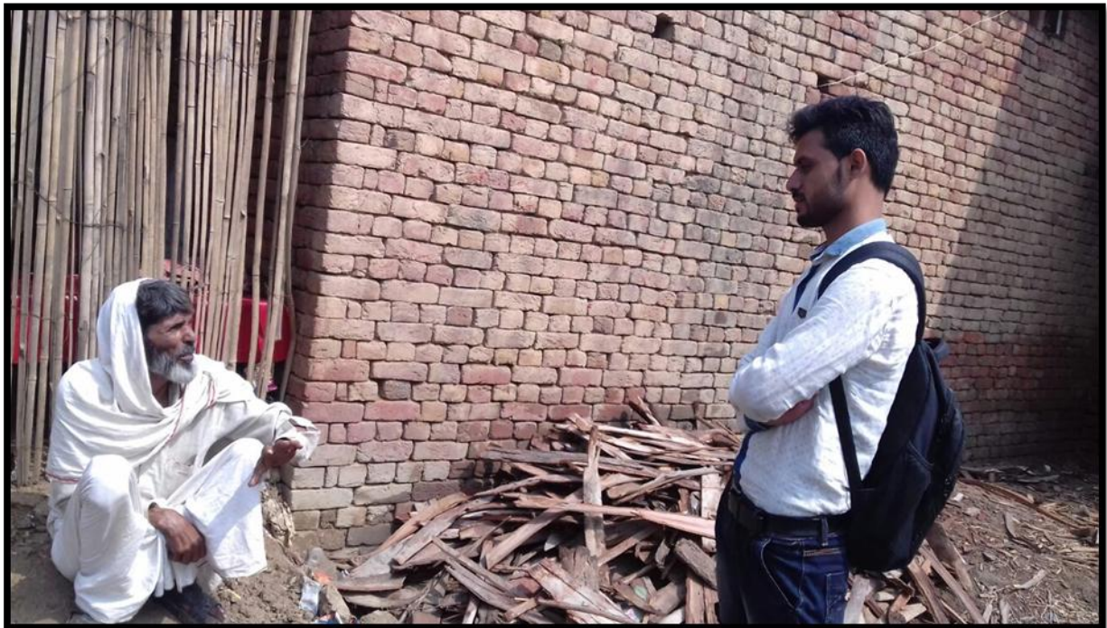
Counselling session on importance of taking timely medicine by ZMQ district Coordinator, Mewat