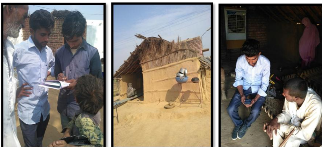
Registration of patients under ACTS